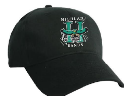
HIGHLAND HS FUNDRAISER HAT 2014 MARCHINGAPPAREL.COM