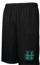
HIGHLAND HS FUNDRAISER SHORTS 2014 MARCHINGAPPAREL.COM