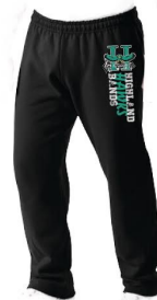
HIGHLAND HS FUNDRAISER SWEAT PANTS 2014 MARCHINGAPPAREL.COM