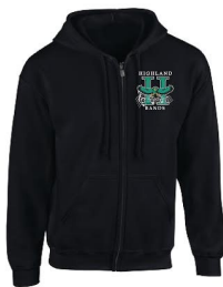
HIGHLAND HS FUNDRAISER ZIPPER HOODIE 2014 MARCHINGAPPAREL.COM