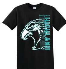
HIGHLAND HS FUNDRAISER PROUD SUPPORTER 2014 MARCHINGAPPAREL.COM