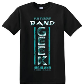
HIGHLAND HS FUNDRAISER FUTURE GEEK 2014 MARCHINGAPPAREL.COM